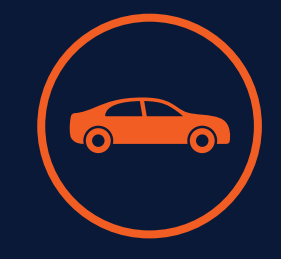
157 CAR PARKING SPACES Including 16 electric car parking spaces

M50 Motorway, N2, Dublin Airport and The Port Tunnel WITHIN PARK ACCESS TO: N2 M50 136.34 м 1 LEVEL ACCESS DOOR 128.95 M 18 DOCK LEVELLERS 4 EURO DOCK LEVELLERS 1 LEVEL Q ACCESS DOOR CAT A OFFICES AND 40 M STAFF FACILITIES DEEP YARD